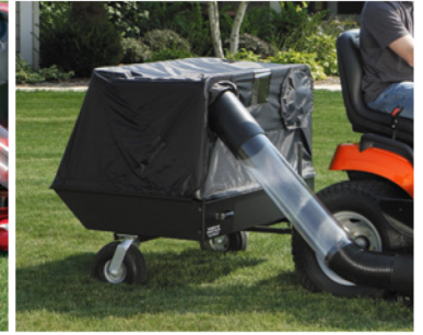
WIDE BODY CART COLLECTOR