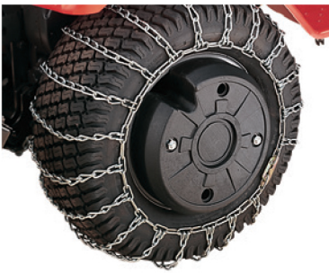
REAR WHEEL WEIGHTS & TIRE CHAINS