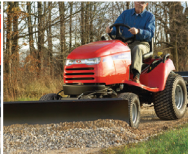
60" DOZER BLADE