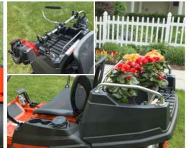
CARGO BED 2 & CARGO BED CLIPS