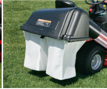
TWIN BAG GRASS CATCHER