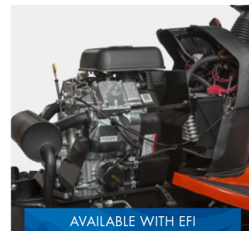
AVAILABLE WITH EFI

VANGUARD® BIG BLOCK™ ENGINE Electronic Fuel Injection (EFI) option allows for easy chokeless automotive-style starting with cold and hot restarts and greater fuel efficiency.