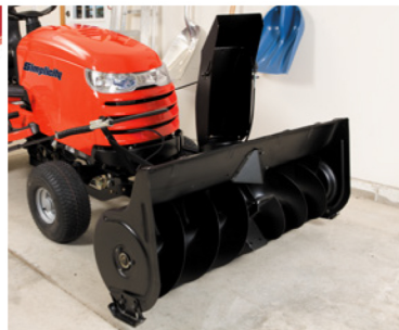
42" SINGLE-STAGE SNOWTHROWER