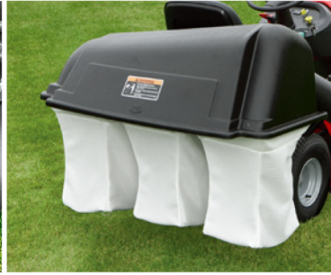
TRIPLE BAG GRASS CATCHER