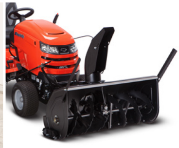
42" & 47" TWO-STAGE SNOWTHROWER