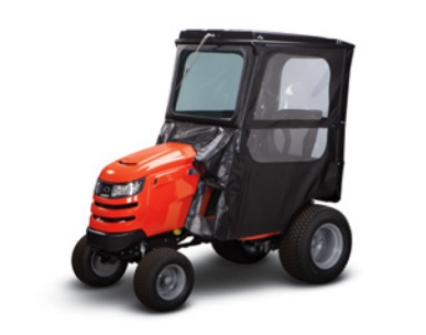
SOFT SNOW CAB