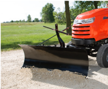
48" DOZER BLADE